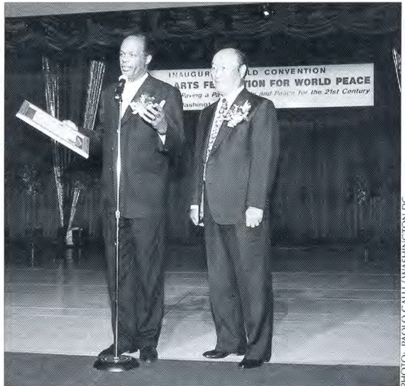
Father receives a plaque of recognition from Mr. Marion Barry, the mayor of Washington DC.