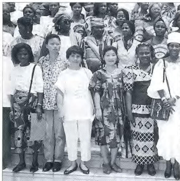
Japanese missionaries with local Ghanaian women.