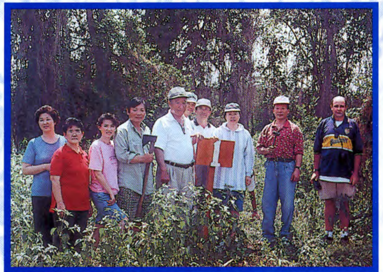
True Parents make a trail of the places they visited in Paraguay.