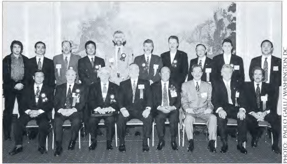
Father poses with VIP participants and staff of the Martial Arts conference.

What kind of world are we living in now? It is hell! No one knew that. I have been fighting all my life to eliminate Satan's lineage from humankind. Yet the world's religious leaders and their followers have been opposing and persecuting me