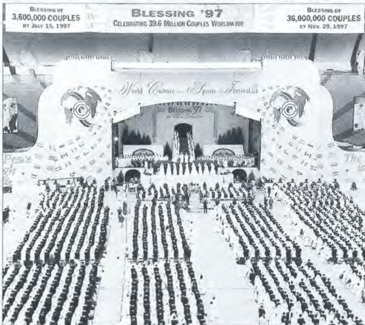
Front Cover: True Parents proclaim the Holy Blessing of 3.6 and 36 Million Couples on November 29, 1997 at RFK Stadium in Washington DC.