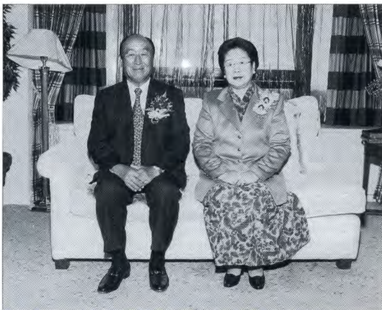
True Parents at the WCSF III Professors World Peace Academy conference, Washington DC.