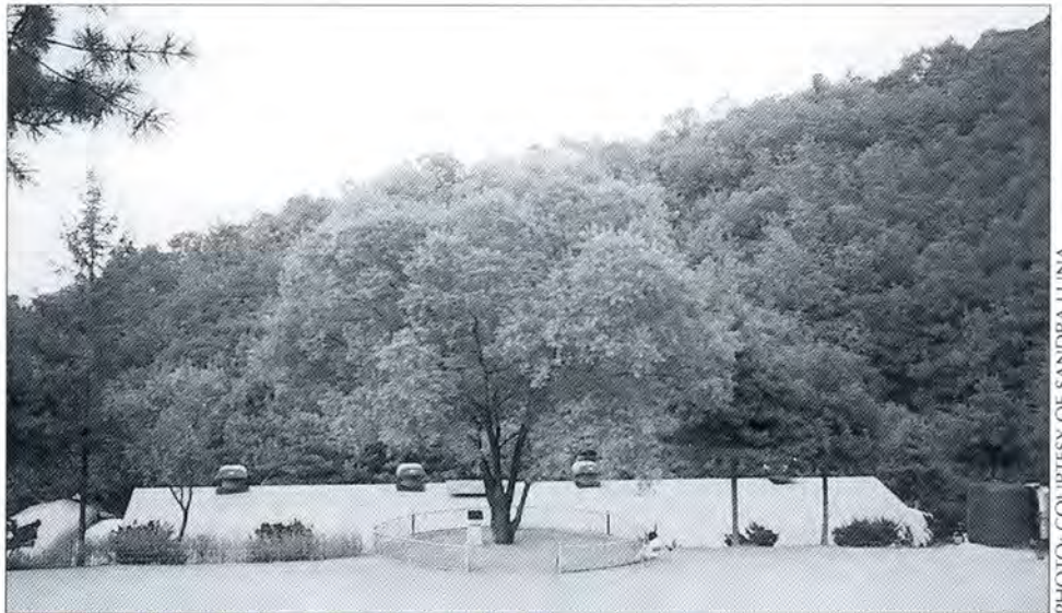
The Tree of Love at the Chung Pyung Lake training center.

Hereditary sin is the sin we inherited from our ancestors. This means that we are held responsible for the sins of our ancestors. The spirits of these evil ancestors have been living with us, many of them even since our birth, waiting for