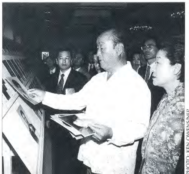
True Parents during the matching on November 3, 1997.

Dr. Sang Hun Lee went to the spirit world and felt desperate to let us know the reality there. He met Jesus, John the Baptist, Adam and Eve, Swedenborg, Kim Il Sung, and found out their status. He said, "Once you are there, there is no freedom. You have a certain status based upon your life on earth, and that is all."